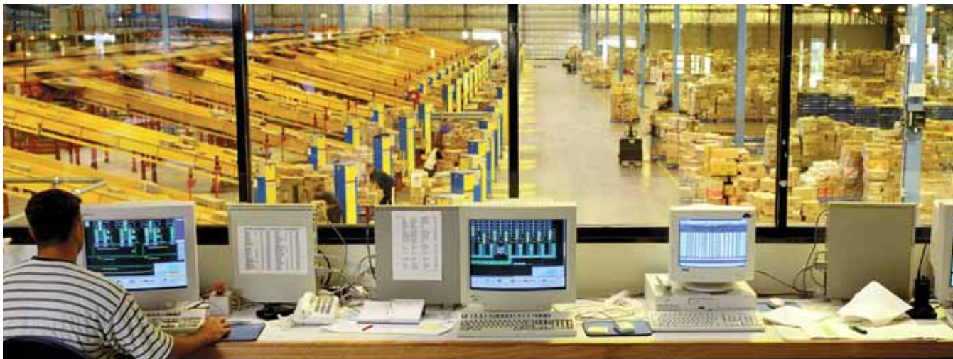
The top five systems suppliers reported combined 2010 revenue of more than $6.83 billion, up 3.3% over 2009.

that order intake has increased favorably and is expected to positively affect upcoming sales revenues.